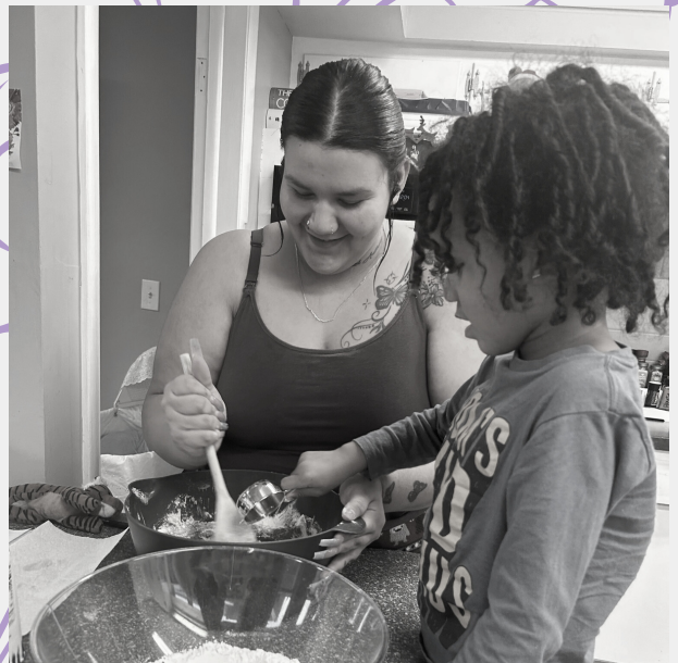
A resident mother and her son bake Christmas treats together