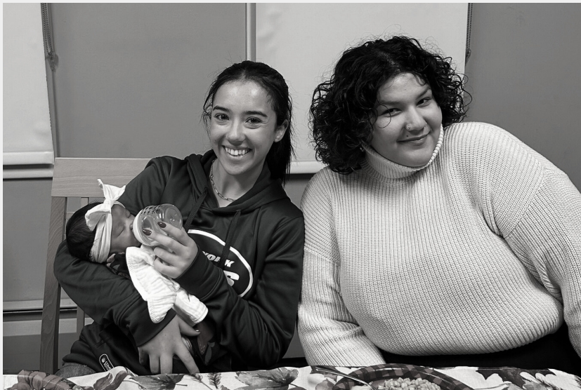
A staff member, a resident mother, and her newborn enjoy a home-cooked Thanksgiving meal together

Love: we lovingly serve one another with compassion and empathy