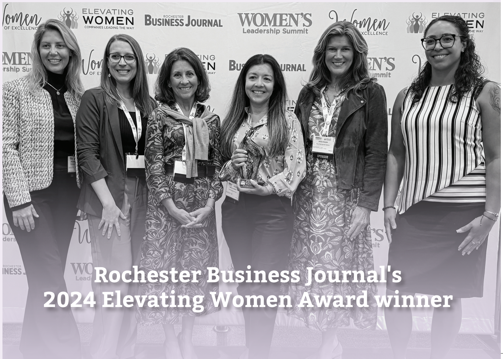
Rochester Business Journal's 2024 Elevating Women Award winner

For more of our services, please visit themargarethome.org